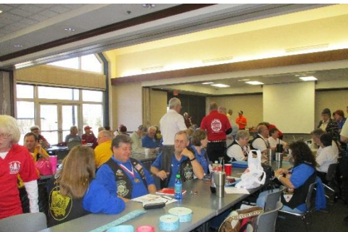
Waiting for the meeting to start