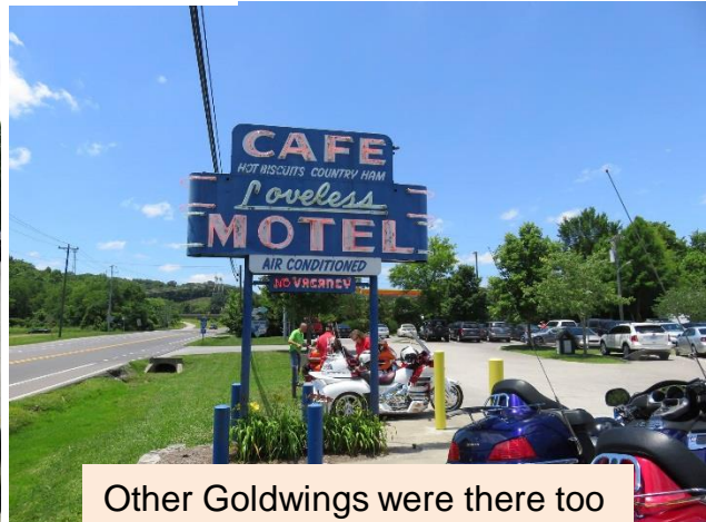
Other Goldwings were there too